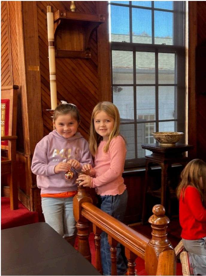
Decorating the sanctuary.